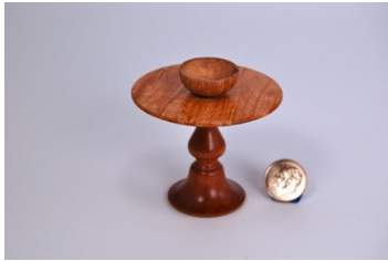
Side Table 2" diameter 2" tall