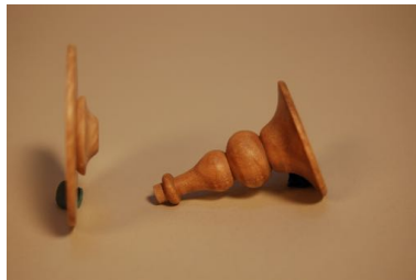
Table Top with Mortice & Table base with Tenon