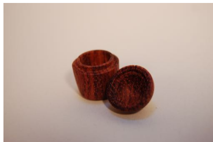
Miniature Bubinga Box for Inspiration & a Future Project