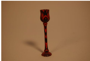
Spectraply Goblet 1 1/4" high by 3/8" diameter

14. Mount a blank (1" x 1" x 2 1/2" plus or minus) for the goblet between centers and turn a foot on it for mounting in a chuck. If using a collet chuck this step can be skipped. Now mount the blank in the chuck and true it up.